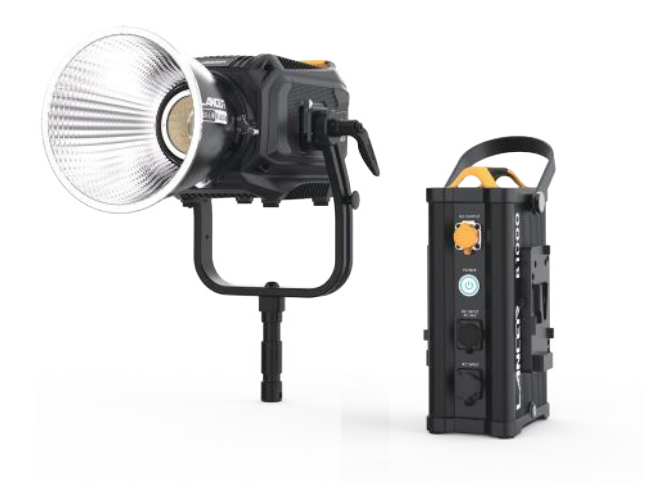
B1000 lamp and power supply (with standard reflector)