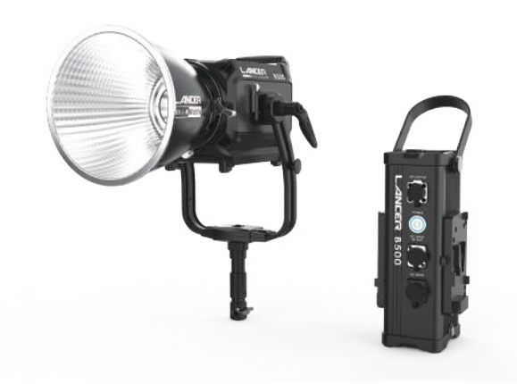
B500 lamp and power supply (with standard reflector)