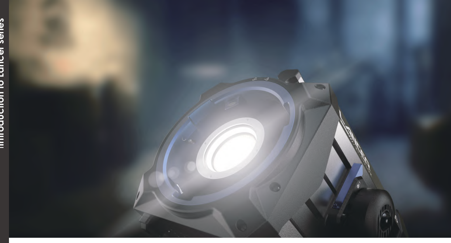
Up to 1500W stable ultra-high power output

LANCER series ranging 500W-1500W is created by a professional programming team with intelligent control technology and new high light COB technology. To improve brightness for various applications, the R&D team self-developed innovative reflector.